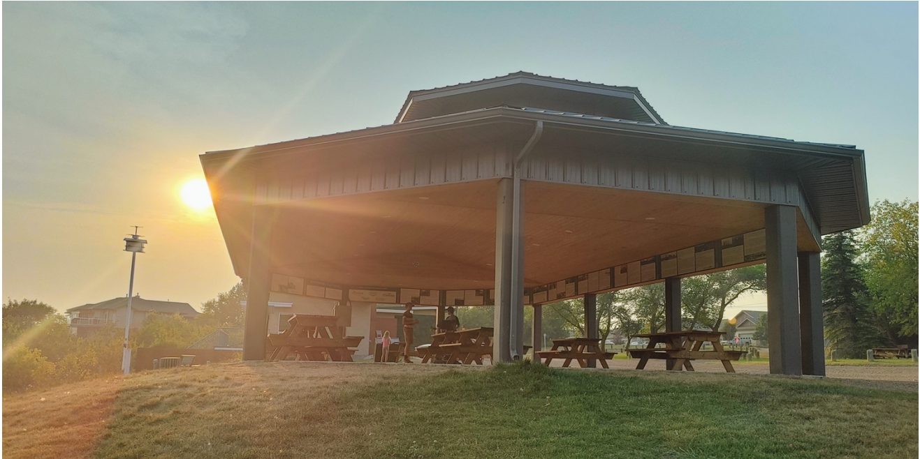
Stoney Creek Park Rotary Pavilion